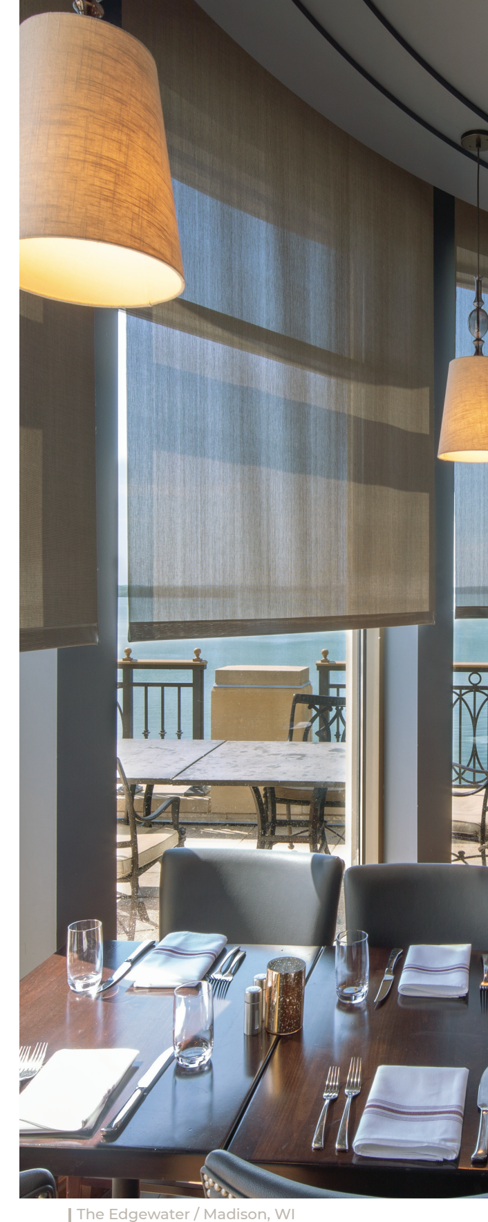
The Edgewater / Madison, WI

Our systems also allow the integration of shades into your central building management system to permit monitoring, and operating from any terminal in your facility. Options include full automation or individual guest room management of shades or draperies.