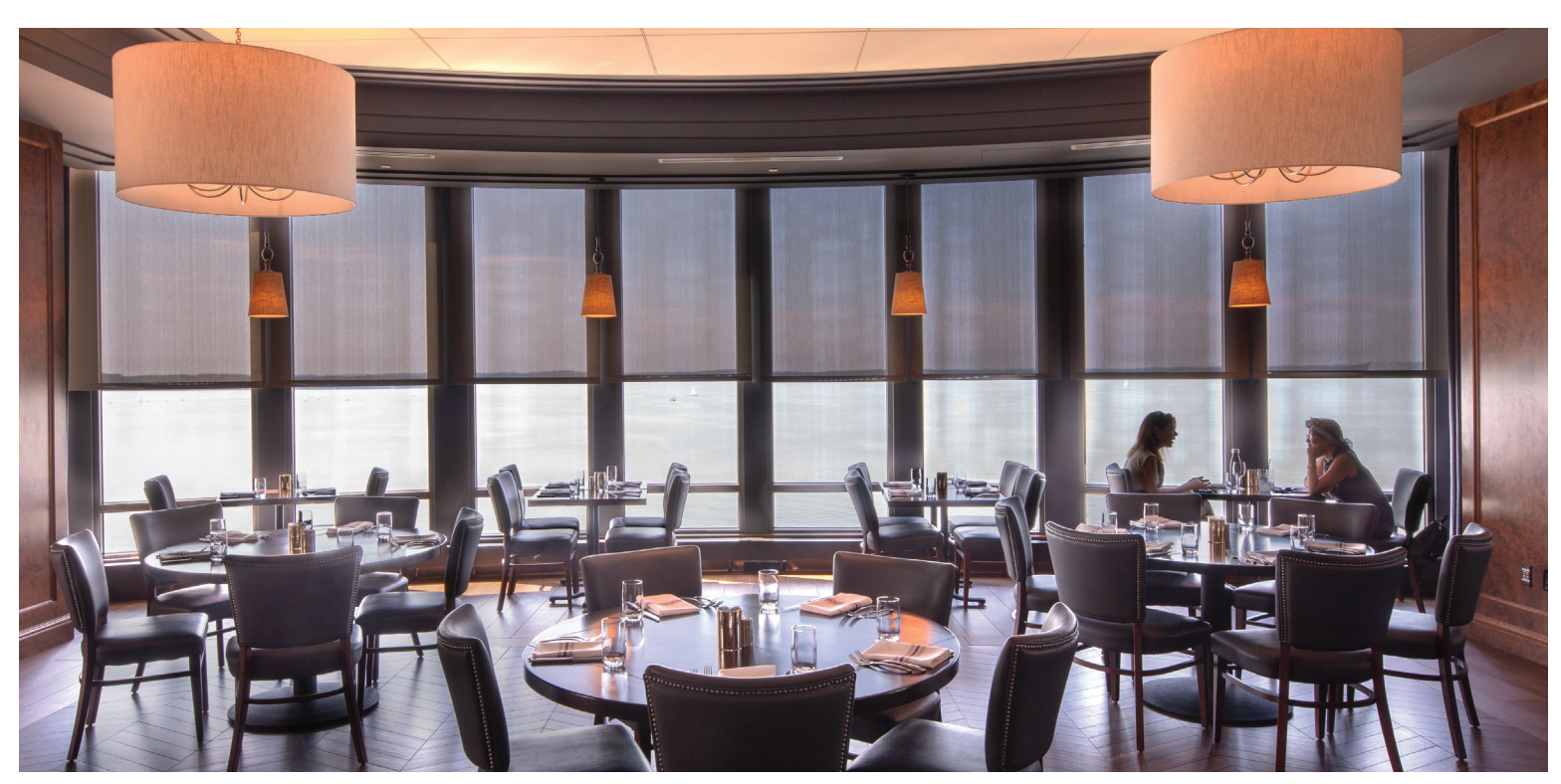
The Edgewater / Madison, WI