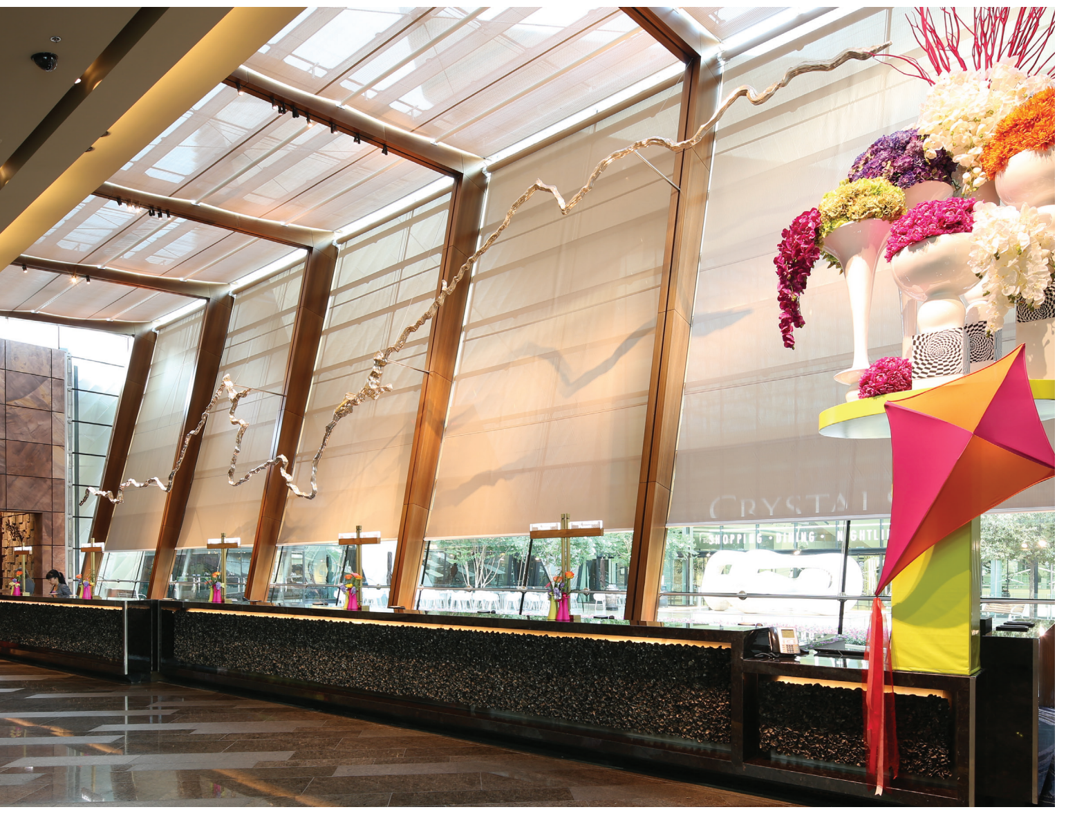
ARIA Resort & Casino / Las Vegas, NV