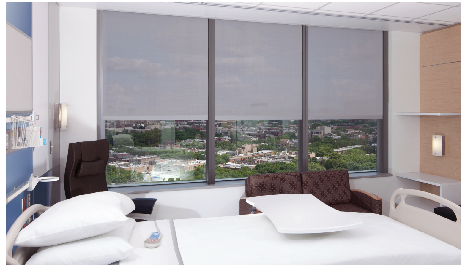
Rush University Medical Center / Chicago, IL

Mecho's shade switches—including pillow and wall—allow the patient, caregiver, or visitor to independently adjust room shading to control daylight and reduce solar heat gain and glare for maximum patient comfort and satisfaction.