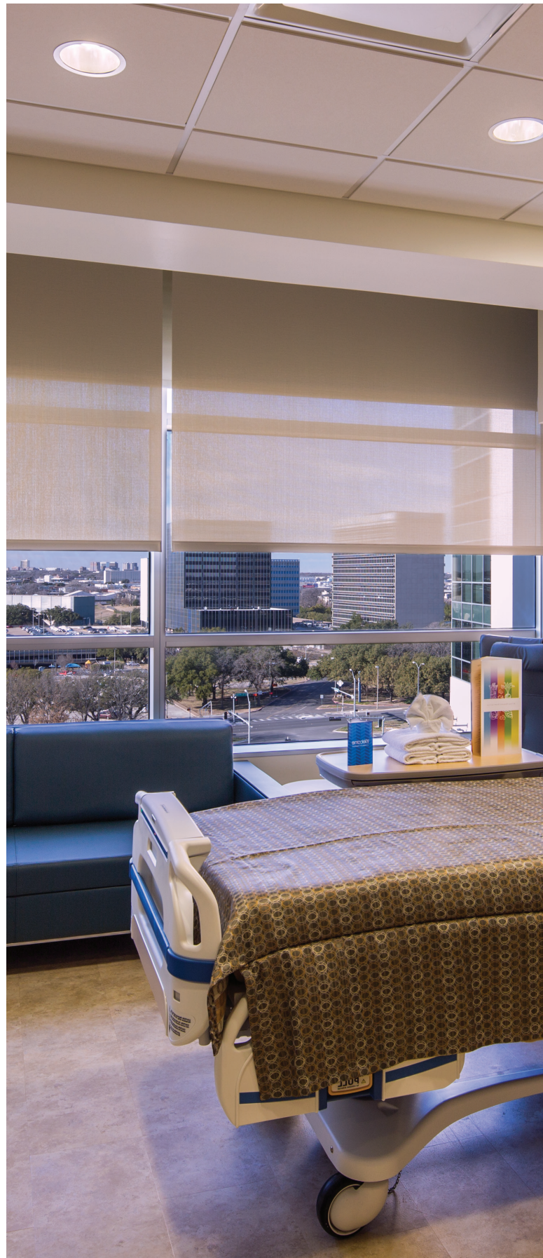
UT Southwestern Medical Center / Dallas, TX