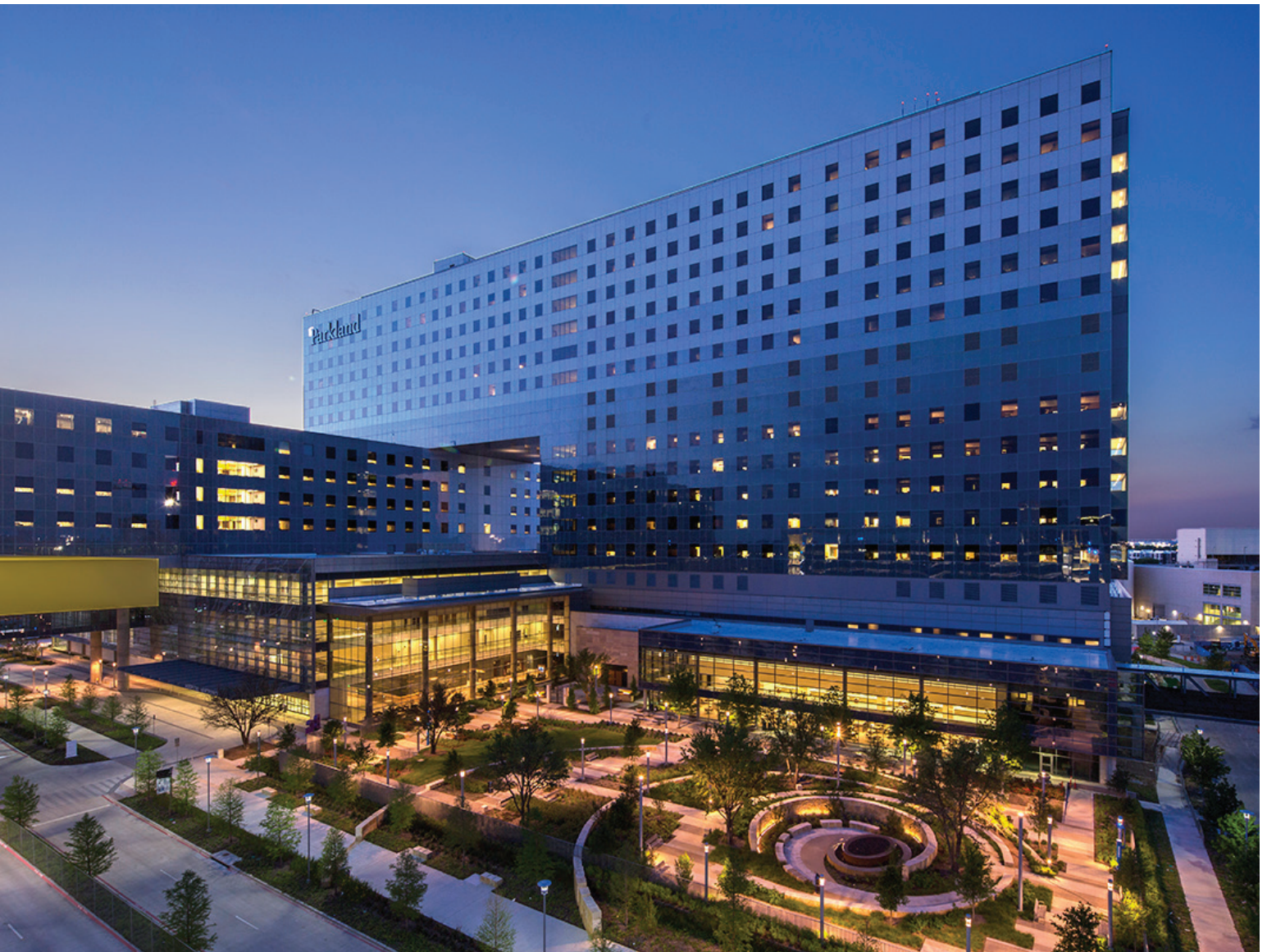
Parkland Memorial Hospital / Dallas, TX